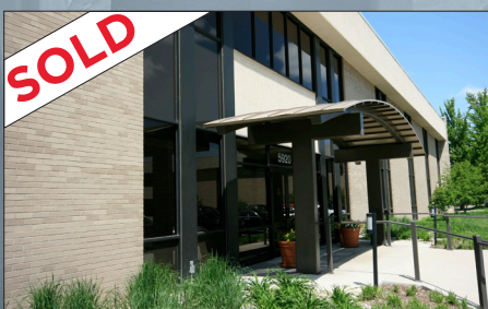
5960 Castleway West Drive Indianapolis, IN 50,291 sf