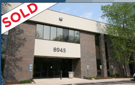
91st & Meridian Indianapolis, IN 112,000 sf