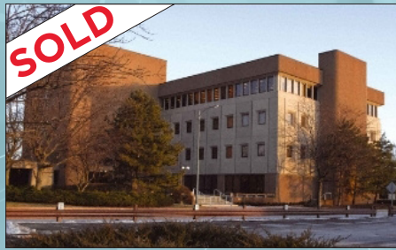
Ball Corporate Headquarters Muncie, IN 130,000 sf