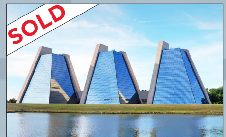
The Pyramids Indianapolis, IN 338,715 sf