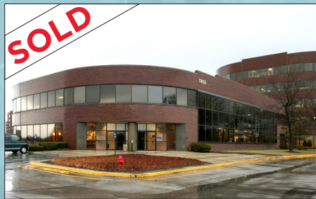
11455 North Meridian Street Carmel, IN 33,000 sf