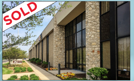
6060 Castleway West Drive Indianapolis, IN 41,000 sf