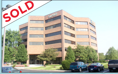
116th & Meridian Carmel, IN 93,000 sf