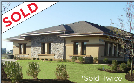
10748 Sky Prairie Street Fishers, IN 24,000 sf *Sold Twice