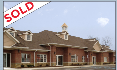
93-293 Creekstone Avon, IN 13,325 sf