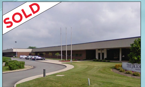
5808 Churchman Bypass Indianapolis, IN 206,000 sf