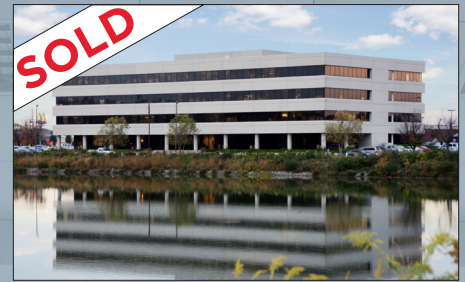
I-465 & 82nd Street Indianapolis, IN 1,100,000 sf