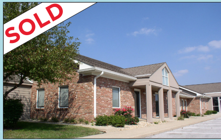
I-465 & East 56th Street Indianapolis, IN 56,000 sf