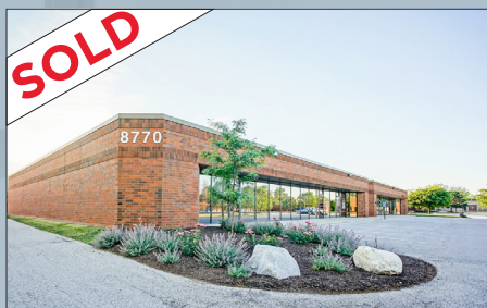
Commerce Park Indianapolis, IN 140,294 sf