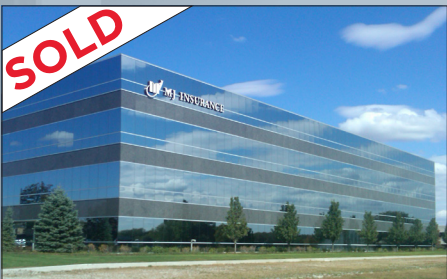
9225 Priority Way West Drive Indianapolis, IN 72,481 sf