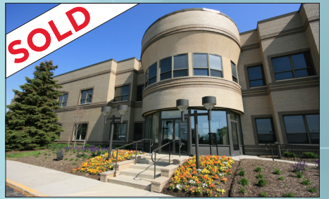
98th & Keystone Indianapolis, IN 96,000 sf