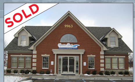
Crosspointe Commons Fishers, IN 40,000 sf