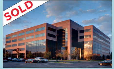
111 Congressional Boulevard Carmel, IN 178,963 sf