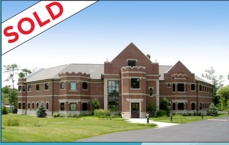
10000 Allisonville Road Fishers, IN 21,000 sf