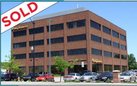
650 East Carmel Drive Carmel, IN 35,000 sf