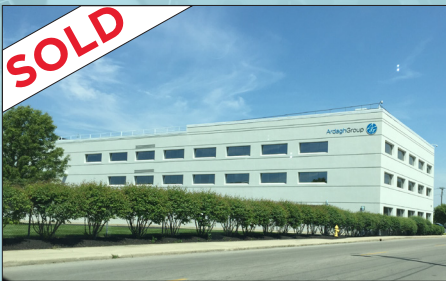
1509 South Macedonia Muncie, IN 96,000 sf