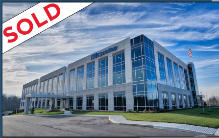
10555 Lids Way Zionsville, IN 150,079 sf