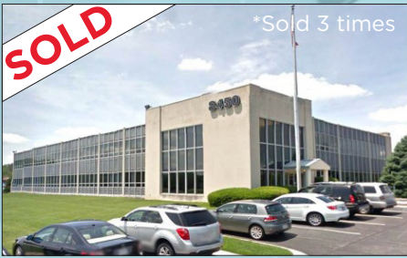
8450 Westfield Boulevard Indianapolis, IN 68,000 sf