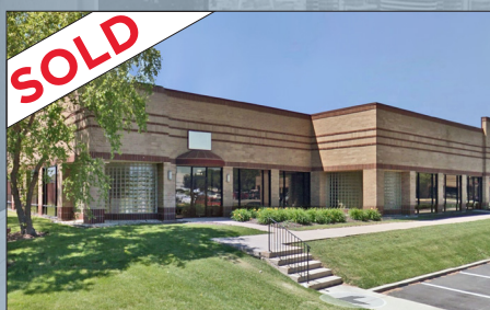
8902 Vincennes Circle Indianapolis, IN 51,876 sf